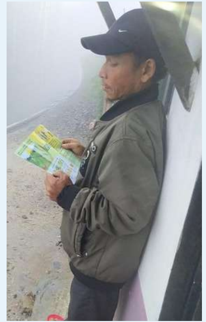
Headman of Laitkynsew raid Mawlieh village