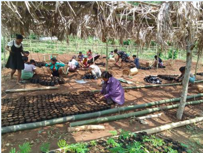
Filling mixing soil in polybags, Rongpetchi Village, Resubelpara, NGH