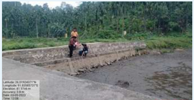
Site visit by the engineers, under INRM MLAMP Ribhoi District to follow up on the construction of Fishery Pond to support INRM livelihood activity at Upper Bagan on the 03rd May, 2023