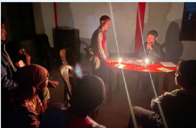
Awareness Program at Umshohphria Village

An awareness program was conducted by at Nongduh/Diengsiar in the Shella block. While many showed interest in applying for the PES scheme, it was noted that their land holdings were small. However, it was encouraging to know that the headman expressed willingness to apply for a community forest, which would also include a sacred grove.