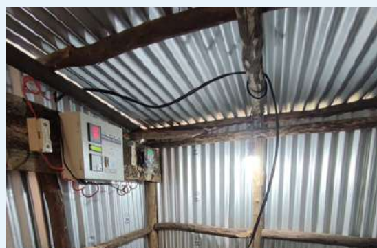
Samanong Village, Amlarem Block, West Jaintia Hills District