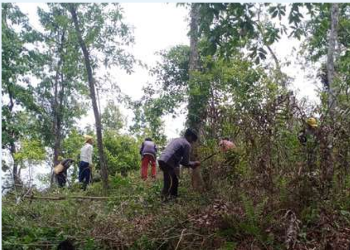
Tuituk Village, Saipung, EJH