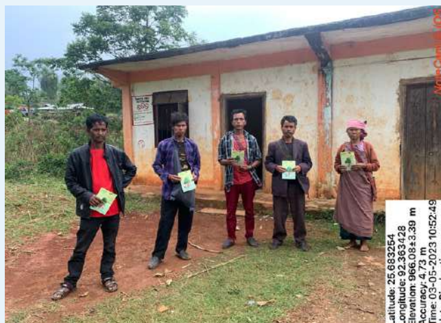
Ringkyntieñ village West Jaintia Hills

An awareness program was held at Umlawang in the Khliehriat block to promote the Payment for Ecosystem Services scheme. Although there is no community forest available, individual forest owners have expressed their interest in the program. However, they have informed that they will first consult with their family members before taking any decision.