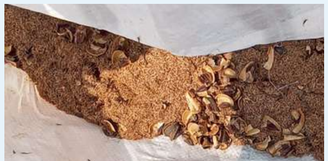
Bolchim seeds, Bangsi Minol