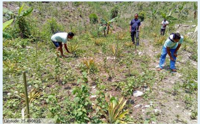
Lining and staking at 2nd plot of Dobakol Changalgitim Village, Baghmara, SGH