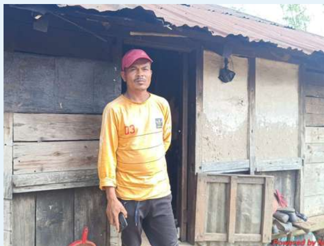
Headman of Iurim Khliehshnong