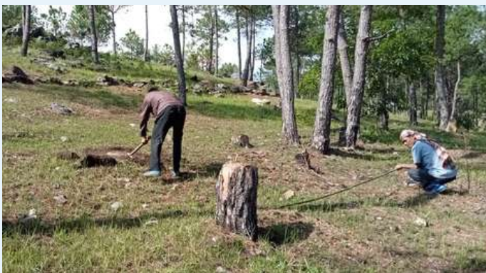
Iapshyndiet Village, Mawryngkneng. EKH