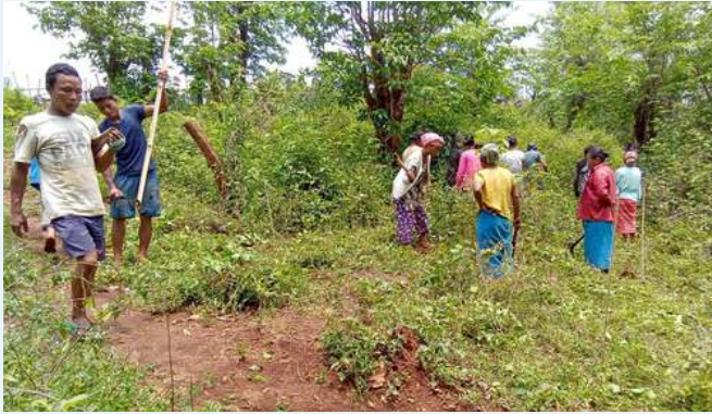
Gambil A'pal Village, Resubelpara, NGH