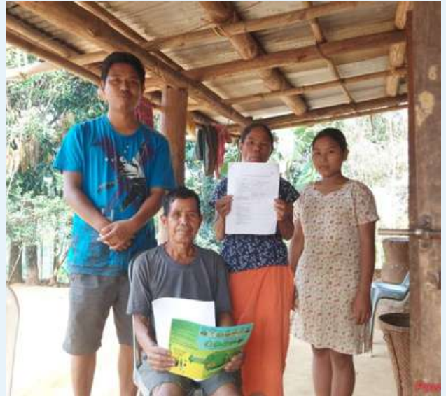
Bolmoram Adinggre village

Following graph shows the district wise total number of applications segregated between community and individual applicants in PES-GREEN Meghalaya phase 2 batch 1