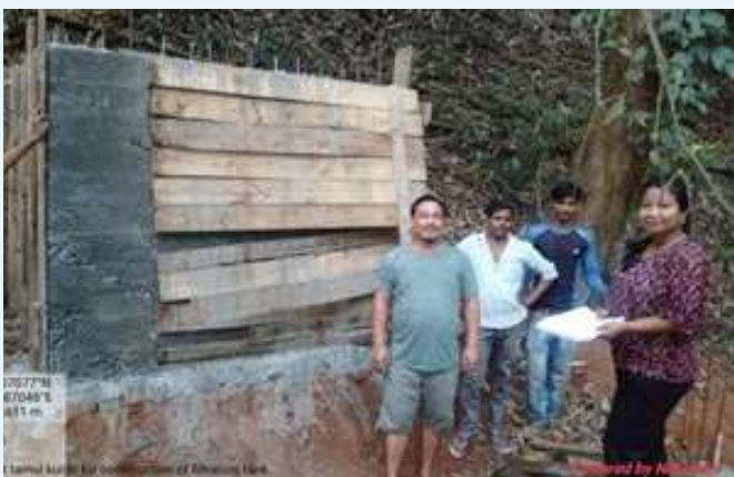
Follow up visit of ongoing INRM intervention at Tamulkuchi, Ri Bhoi District on the 3rd of May 2023