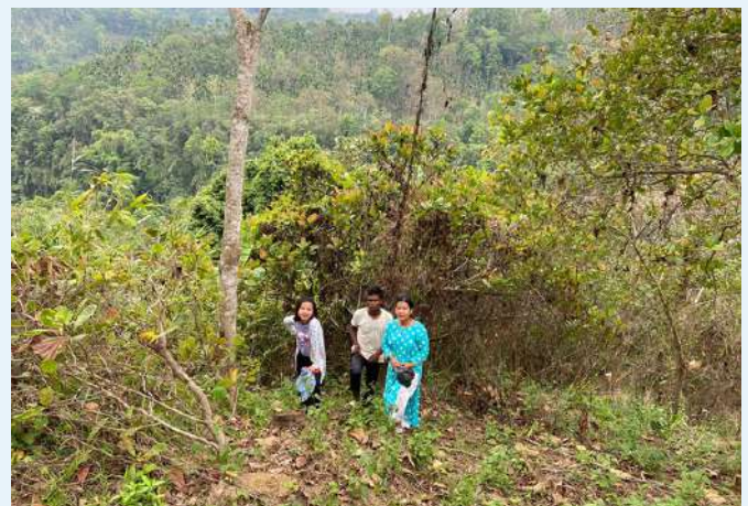
Identification of plantation model at Gnengkolsi Songgitcham Village, SGH