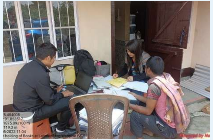
RF staff of SWKH carried out an activity to check the of Books of Accounts and Registers of Laitmawlong Wahpein IVCS Ltd, SWKH in order to prepare for Audit.