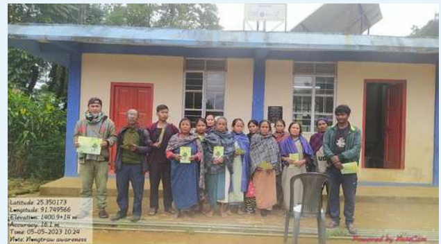
Nongtraw village Khatarshnong Laitkroh Block