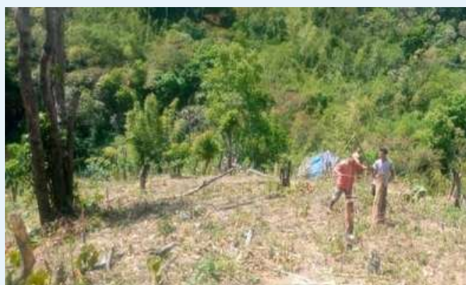
Sasatgre land preparation for SALT cultivation