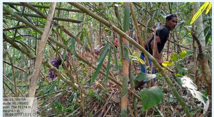
Manggakgre Village, Rongram, WGH