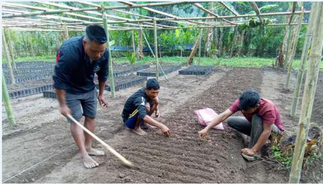
Sowing of Indian mahogany at Dogegpipuram Village, Dambo Rongjeng, EGH