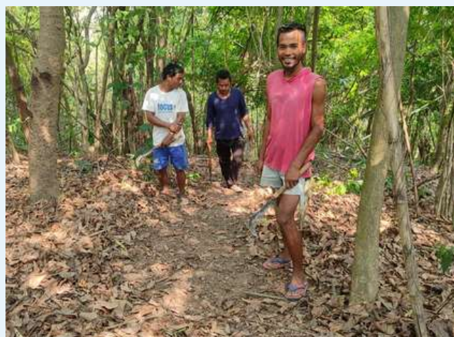
Plantation area, Darenggagre Village, Dalu, WGH