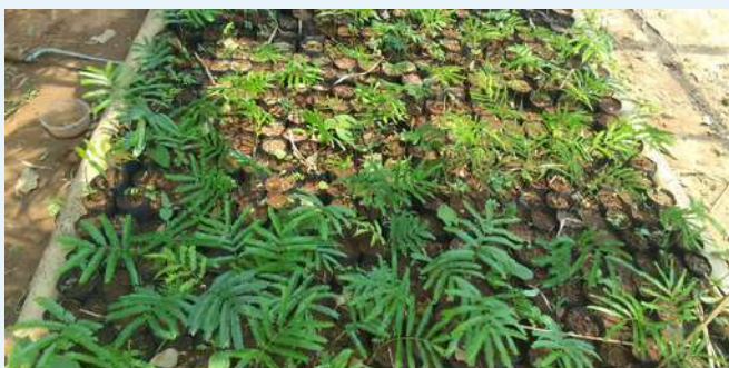
Perkia spesiosa seedlings, Rongpetchi Village