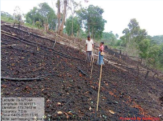
Salt Farm at Kalak Songgitcham, Samanda, EGH

SALT training is being imparted to farmers of the MegLIFE Project wherever feasible to improve land productivity and fertility. The technique is enthusiastically being adopted by the trainees.