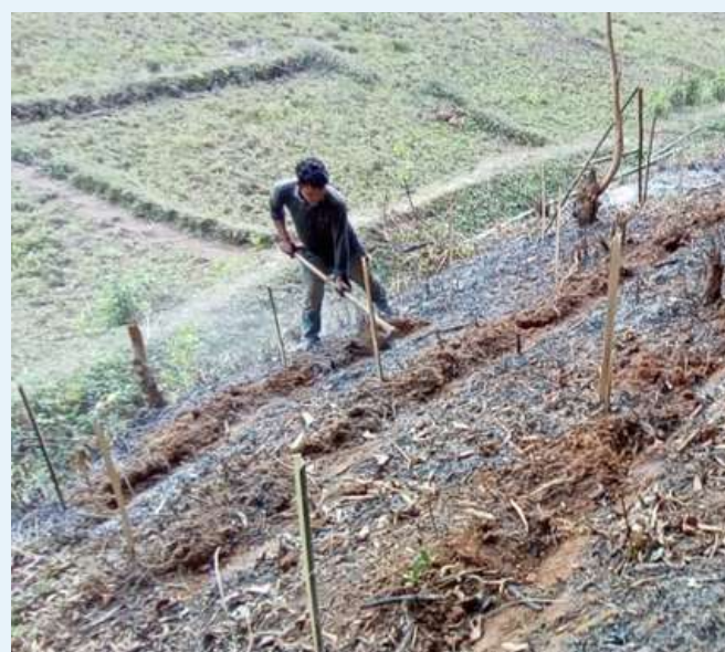
Preparation for SALT cultivation at Chandigre, Rongram