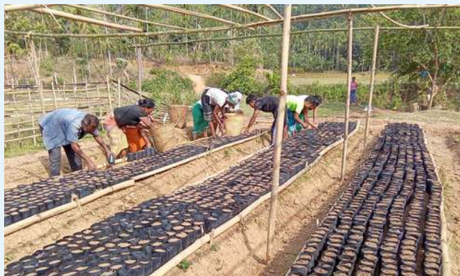
Chorepahar Village, Resubelpara, NGH