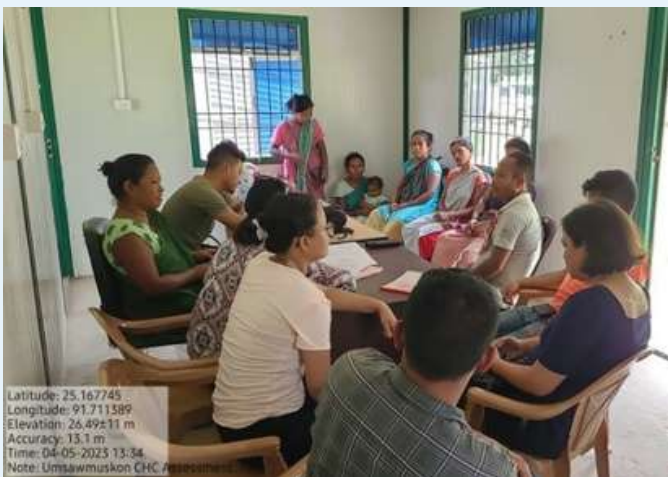
Latitude: 25.167745 Longitude: 91.711589 Elevation: 26.49511 m Accuracy: 13.3 m Time: 04-05-2023 13:34 Note: Umsawmuskon CHC Assesment

One Day Training Program on Bookkeeping and Record Maintenance for the IVCS with CMC, CHC and Processing Unit was Organised by ISC&ED Team in Collaboration with INRM Team, MLAMP, DPMU, SWKHD on the 3rd of May, 2023. This programme was conducted at Multi-purpose Hall, DC's Office, Mawkyrwat