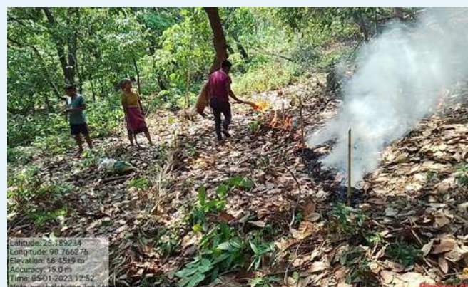
Contour line preparation is completed in all villages under Rongara Block