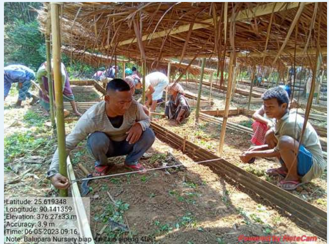
Measuring of bed width (4ft). Balupara Nursery, Rongram, WGH