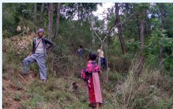
Advance work at Mawtharap, Mairang, WKH