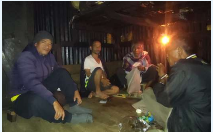
Awareness Program at Pynai Village