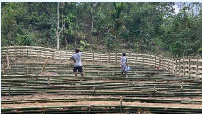
Nursery bed preparation at Dompaigne Village, Gasuapara, SGH