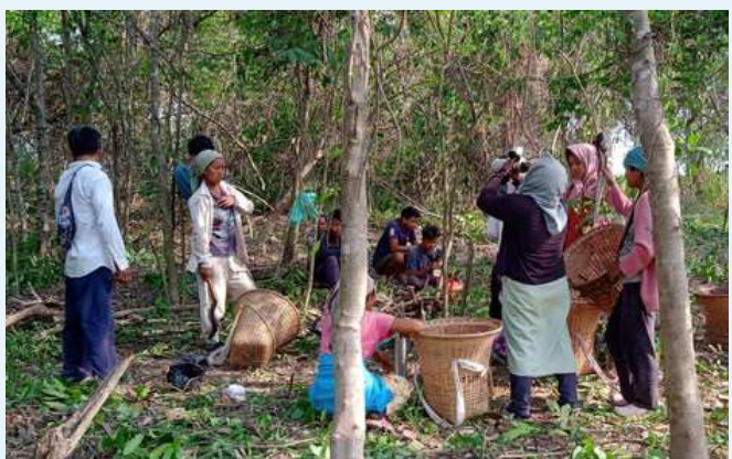
Advance work at Abendagre Village, Gambegre, WGH