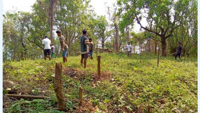
Kalwe Village, Kharkutta, NGH