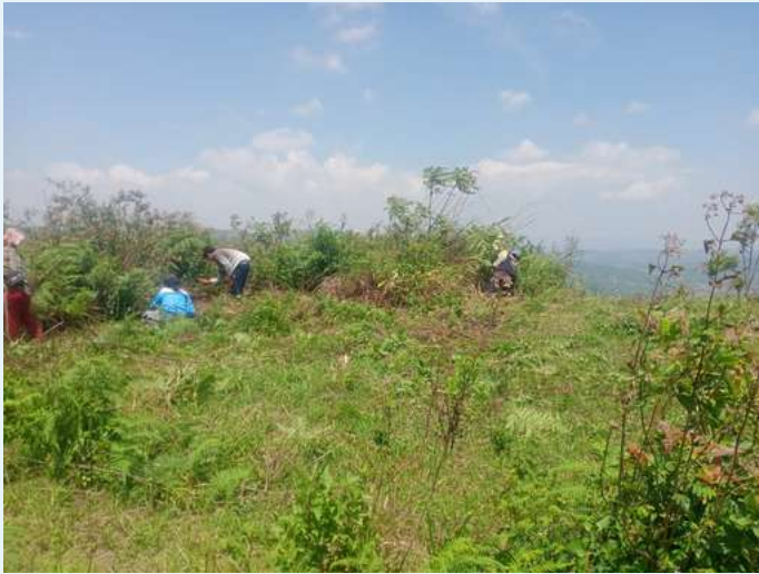
Saipung Village, Saipung, EJH