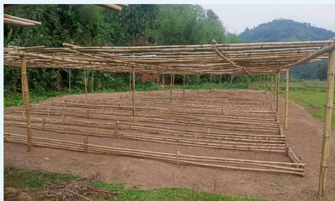
Guresimram Village nursery bed preparation, Resubelpara, NGH