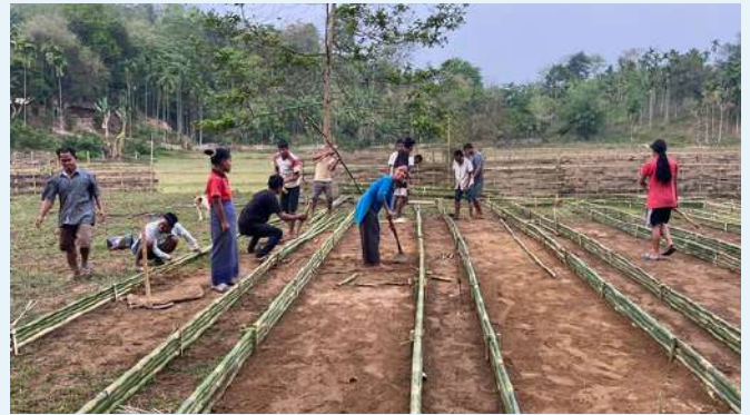
Nursery bed preparation at Ruatsogre Village, Gasuapara, SGH.