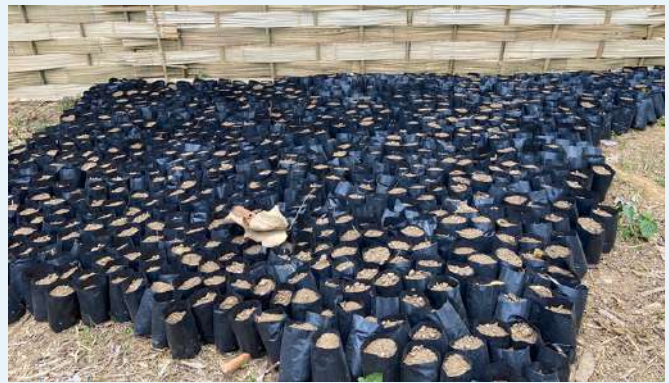
Men prepared nursery beds, while women filled poly bags with soil for efficient work at Gnengkolsi Songgitcham Village, SGH