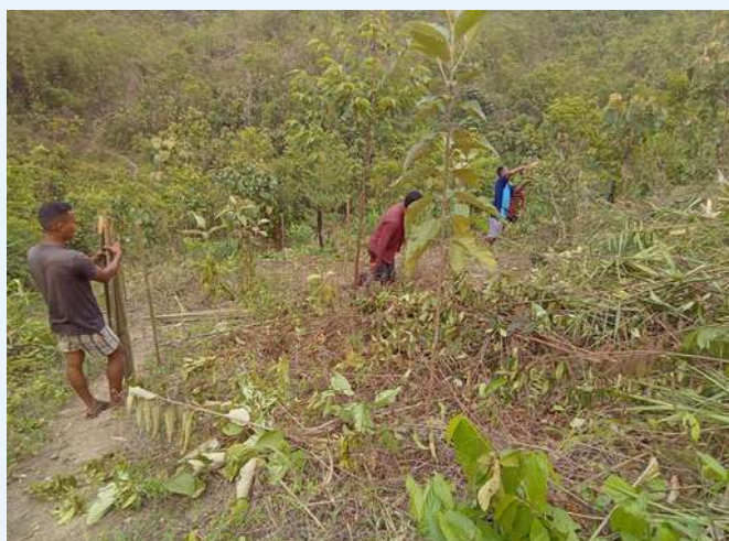
Stacking of poles at Dolwarigre Village, Samanda, EGH