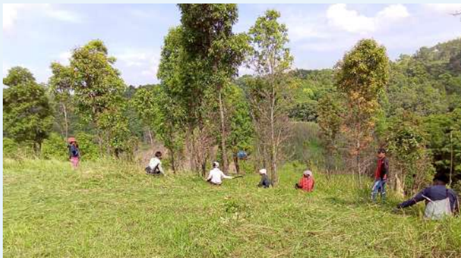
Jungle Clearance at Tuidam Village, Saipung, EJJ