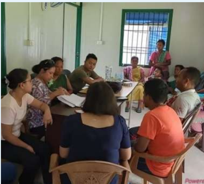
Umsawmaskon CHC Assessment activity was carried out at Shella Bholaganj Block EKHD