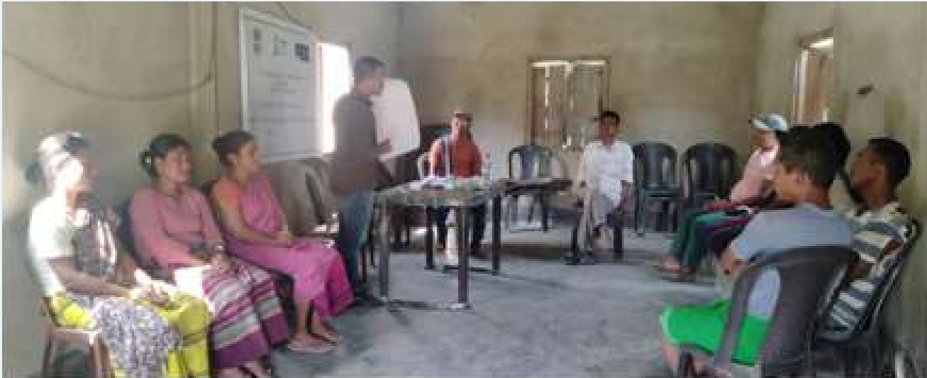
Rubberkhuli village recently had a presentation of their assessment scores and grades using a web diagram on May 2, 2023.