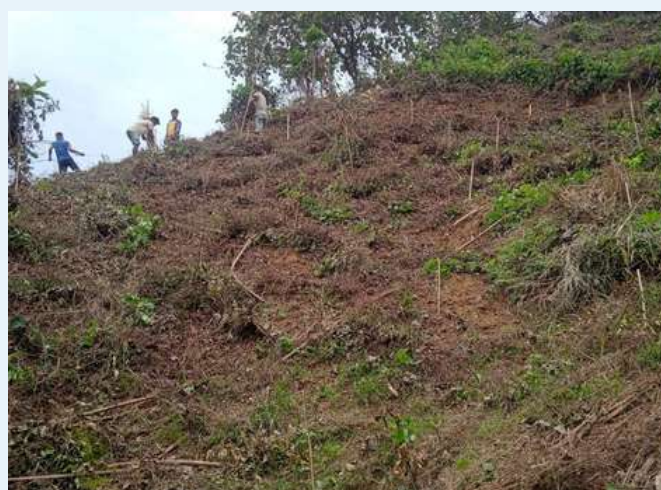
Advance work at Ritekpara, Zikzak, SWGH