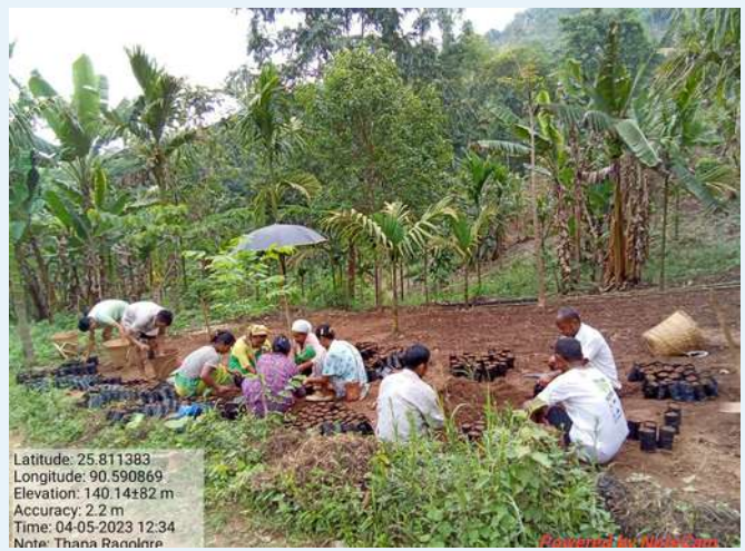
Filling of soil in poly bags at Bangsi Minol Village, Resubelpara, NGH