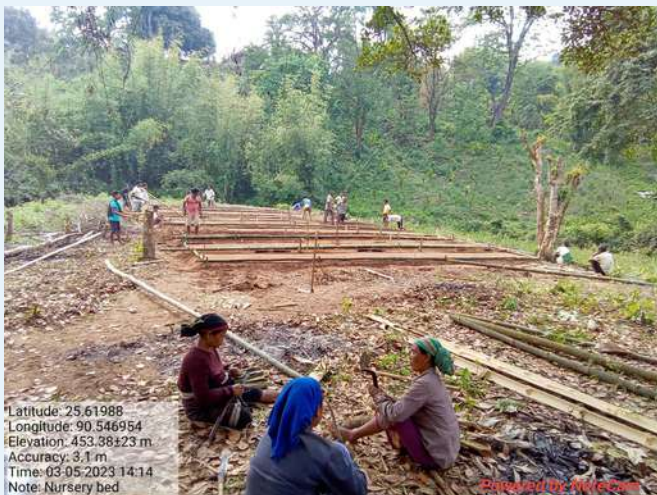
Bed preparation at Rongreng Nokat Village, Songsak, EGH