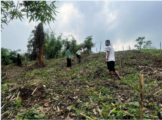
Chibilbang Village, Dambo Rongjeng, EGH.