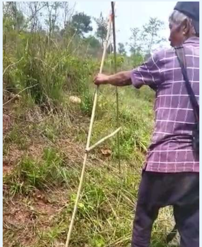
Land preparation at Umniangriang Village, Mairang, WKH