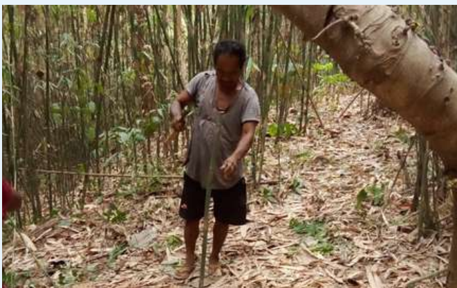
Advance work at Skagre Village, Betasing, SWGH.