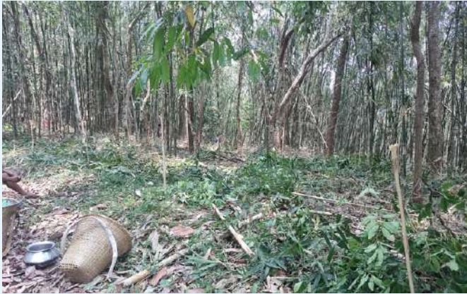
Stacking for plantation at Kalak Songgital Village, Samanda, EGH

MegLIFE communities are hard at work to achieve the project's goal of covering 22,500 hectares of plantation. Site preparation and advance works are currently underway.