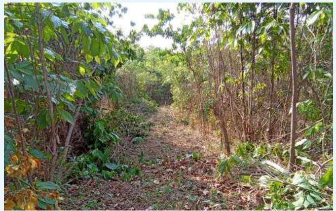
Jungle clearance Daranggagre Village, Dalu, West Garo Hills