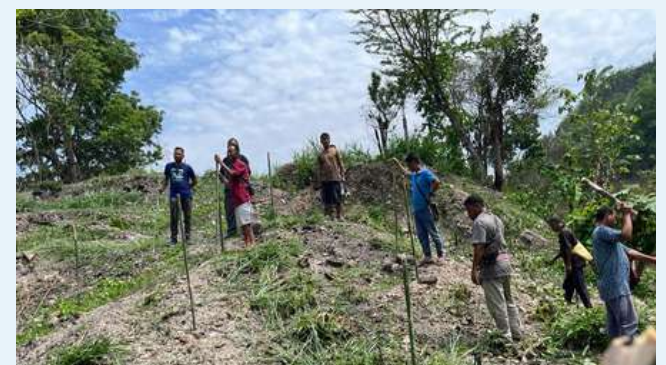
Cutting down of weeds and other less important plants, and lining and staking out in the gaps between existing trees at Era Aning Village and Agrenggitim Village, Baghmara, SGH