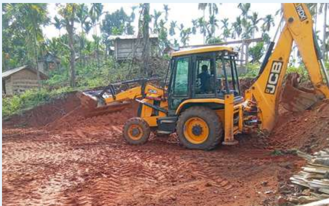
Land preparation at Kentra, Songsak, EGH

The construction of 370 community halls has been sanctioned under EPA of MegLIFE. Initial phases of site preparation is underway.