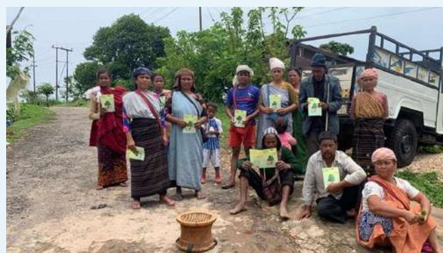
Pdieniamusiang Village West Jaintia Hills