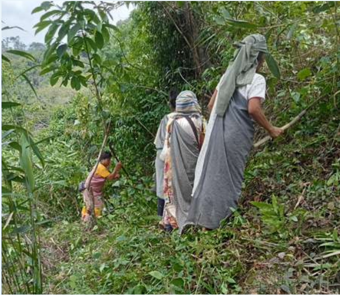
Advance work at Nongnam, Mawbri, Mawtangden, Mawkhyrwang Villages under Mawkyrwat, SWKH