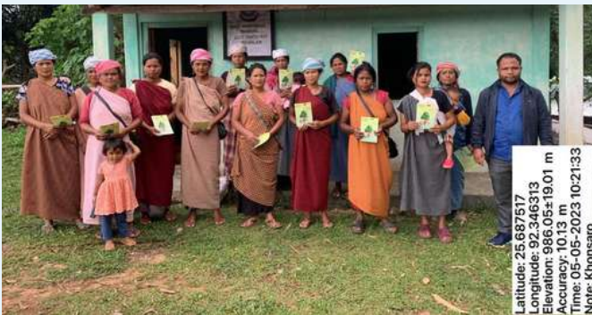
Khonsaro village Thadlaskein Block

A meeting was held with the Headmen of Mawkapiah and Iewnongma villages, and it was decided that an awareness program will be conducted soon.