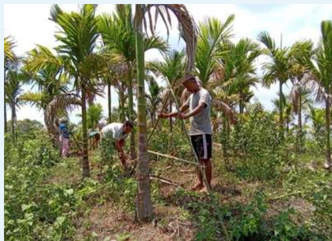
Anogre preparation for SALT cultivation