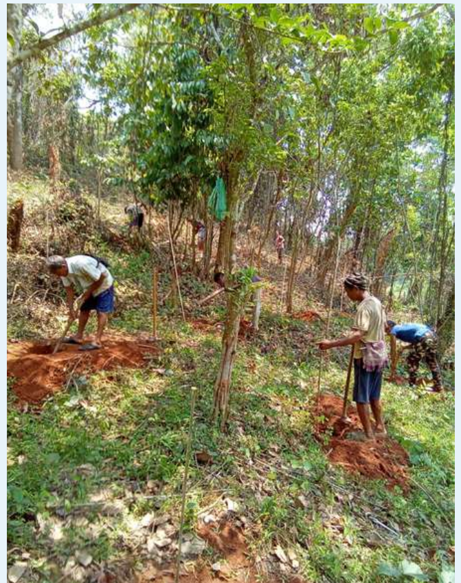
Lining, stacking and pitting at Renchagre Village, Rongram, WGH