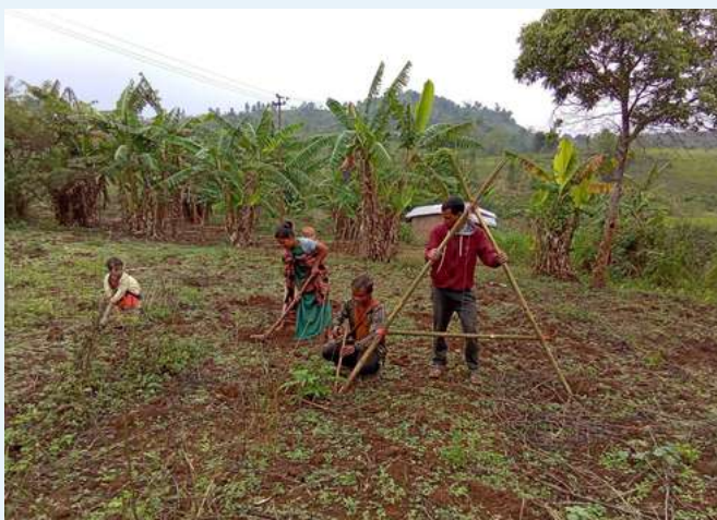
SALT farm of Ma Didimus at Lakaroi Pnar village