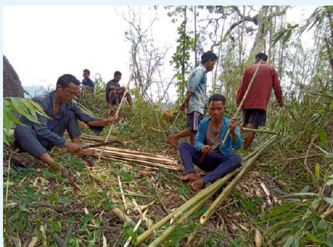
Dambo Charegittim plantation, Dambo Rongjeng, EGH