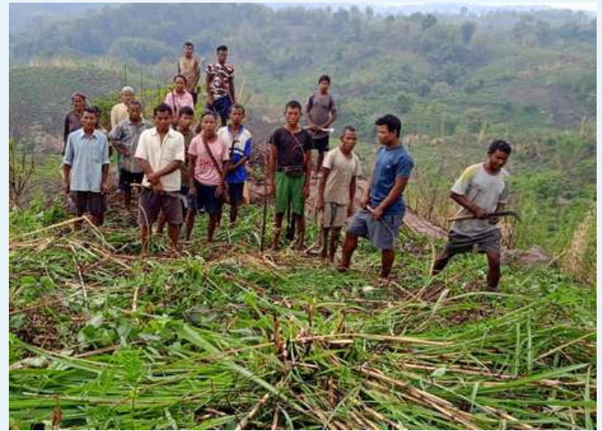
Thaugittim Village, Dambo Rongjeng, EGH