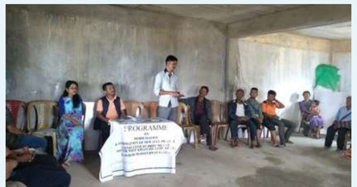
Awareness Program on mobilisation of formation of IVCS phase III at Mawbidong (Sanshnong) was conducted on the 8th of May 2023 by MLAMP staff SWKHD in collaboration with the office of SRCS