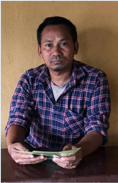
Headman of Amlari model village