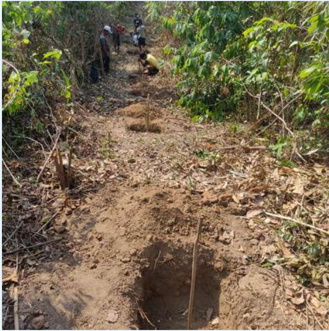
Junngle clearance Rangdapara Village Dalu, West Garo Hills.