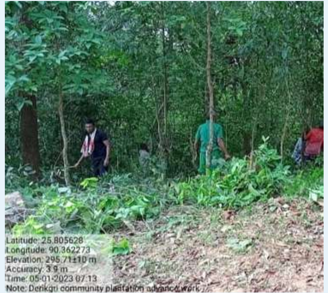
Jungle clearance at two plots for Social Forestry and Reserve Forest at Derikgre Village under Rongram, WGH