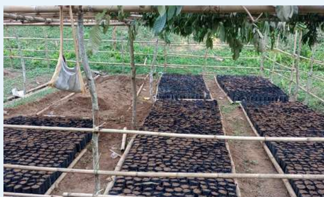
Community Nursery at Kalak Songgital, Samanda, EGH