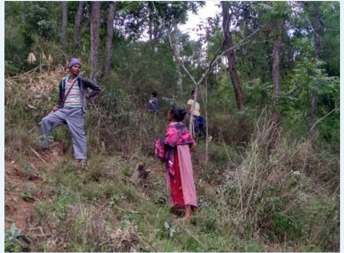
Mawtharap Village, Mairang, WKH