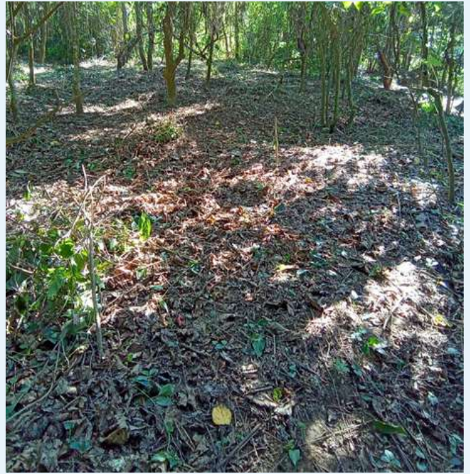
Advance work for plantation at Kopogre Village, Gambegre, SWGH