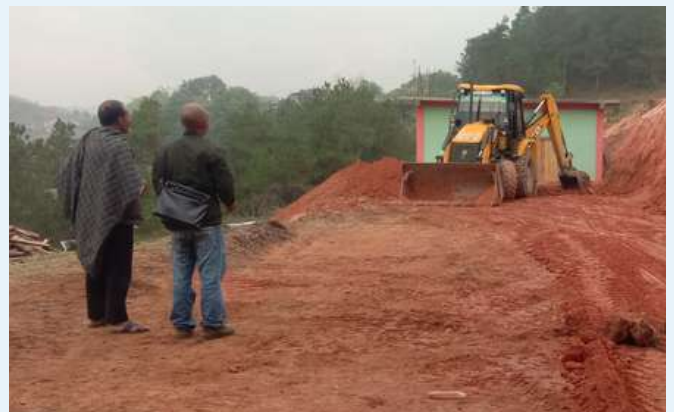
Earthwork at Sohtyngkhur Village, Mairang, WKH