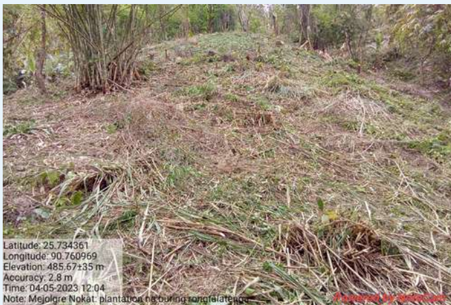
Mejolgri Nokat Village, Dambo Rongjeng, EGH