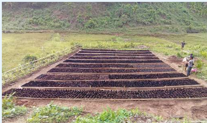
Khaldang Tunaturam (Agitok) Village, Resubelpara, NGH

433 Villages under MegLIFE Project have elected to set up community nurseries. Following the completion of preparation of nursery mother beds where seeds will be sown, communities are working on filling Polybags with potting material; a mix of soil, sand and compost (in prescribed proportion). Polybags are for transplanting the small seedlings from mother bed into a container for transportation to the planting site.