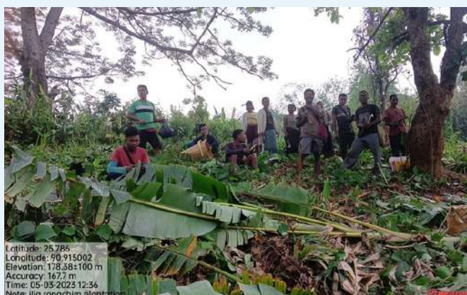
Advance work at Illa Rongchim Village, Kharkutta, NGH