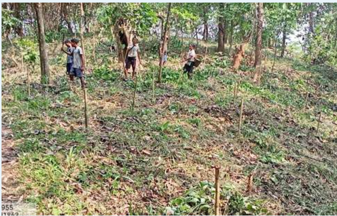
Jungle clearing of additional plot at Rongpetchi Village, Resubelpara, NGH