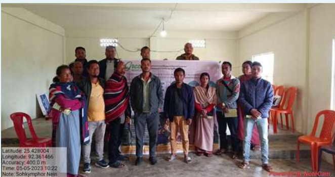
Sohkymphor village Khliehriat Block