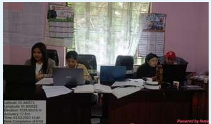
Data collection on KYM of Mawmihthied, Sohrarim, Nongthymmai Lumthangding and Umlympung IVCS.