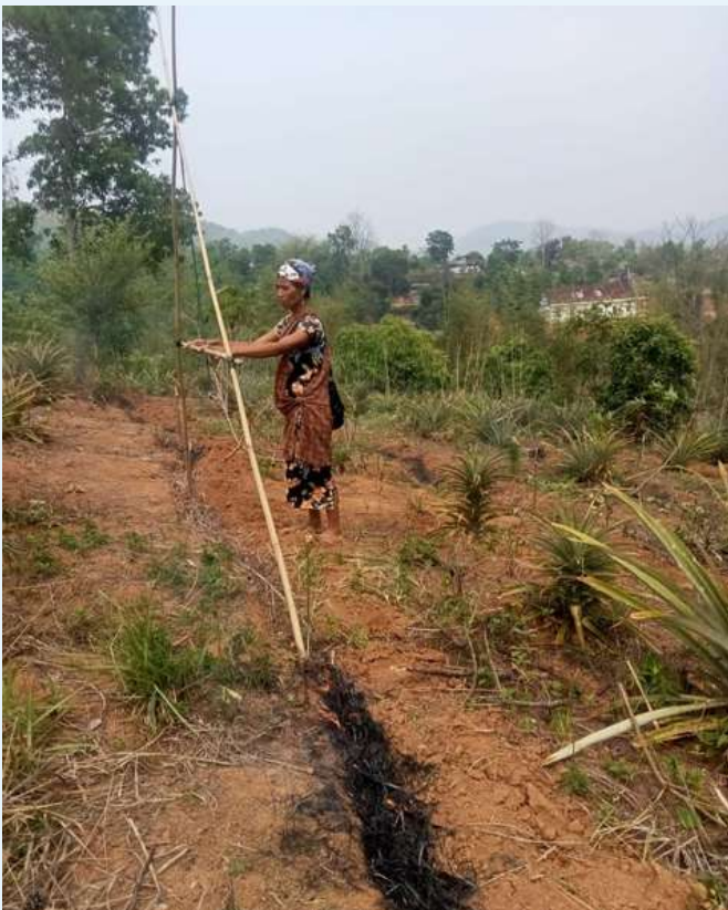
Land preparation at Dongkiingding Village, Mairang, WKH