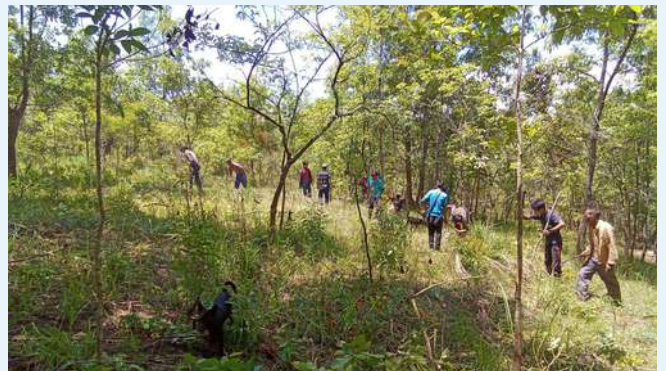
Advance work Situng Village, Saipung, EJJ