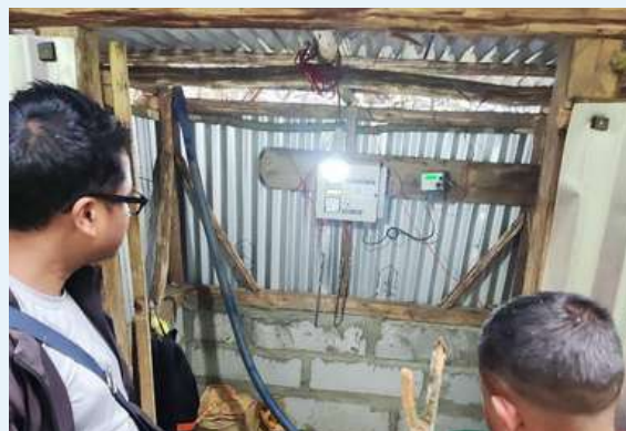
Kdohhati Village, Umsning Block, Ri Bhoi District