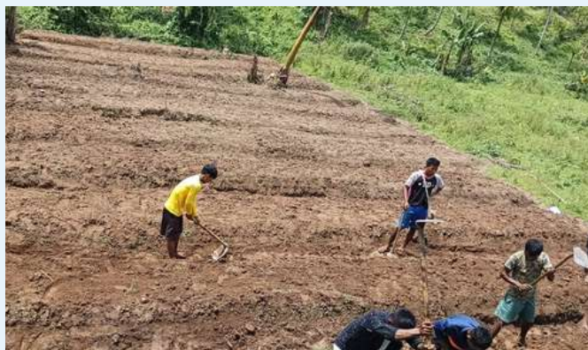
Bed preparation at Dokongsi C Village, Kharkutta, NGH