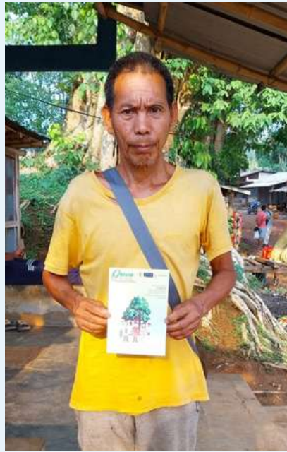
Sordar of Rongrong village