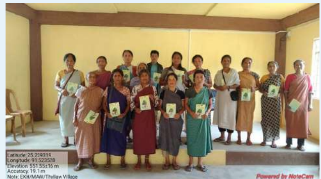
Thyllaw Village Mawsynram Block