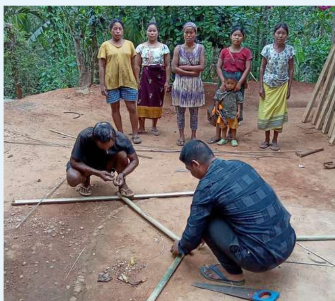
Preparing contour lines at Dangkong Chitoregre, Songsak, EGH