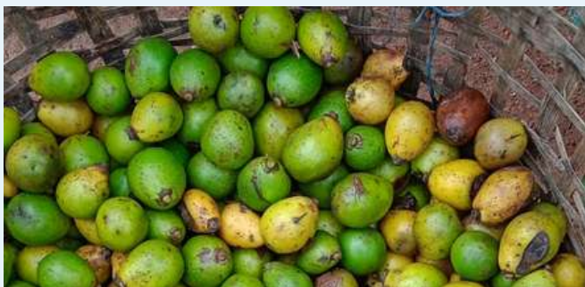
Gambare Seeds. Bangsi A'ga Village.