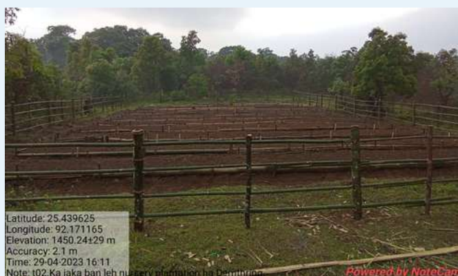
Work in progress at Demthring Village Nursery, Thadlaskein, WJH