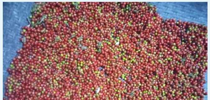
Bolgitchak seeds. Nani A'pal Village