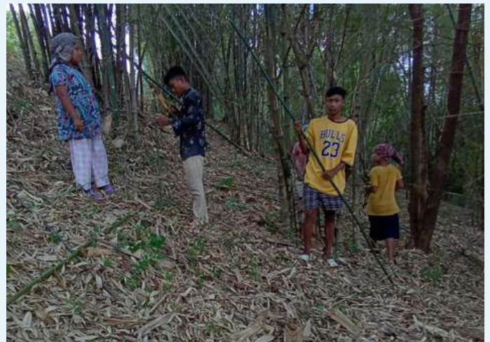
Gitokgre Village, Samanda, EGH