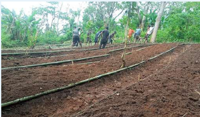
Nursery bed preparation at Rangsa Village (batch 2), Kharkutta Block, North Garo Hills