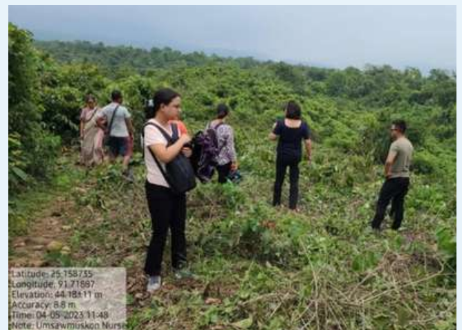
Latitude: 25.158755 Longitude: 91.71887 Elevation: 44.18411 m Accuracy: 8.8 m Time: 04-05-2023 11:40 Note: Umsawmuskon Nurs

Site inspection was conducted for Multi purpose Nursery and FFS (convergence of INRM & ISC ED) for Agronomic activities at Kurikhal village under Shella Bholaganj Block EKHD