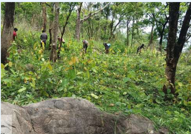
Dokongsi C Village, Kharkutta, North Garo Hills