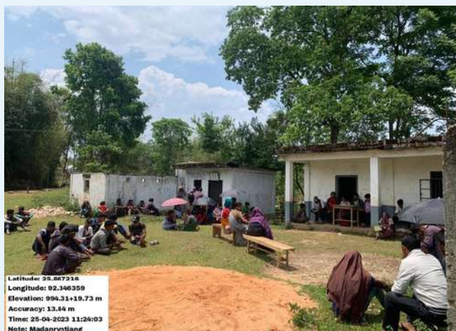
Madanryntiang Village West Jaintia Hills