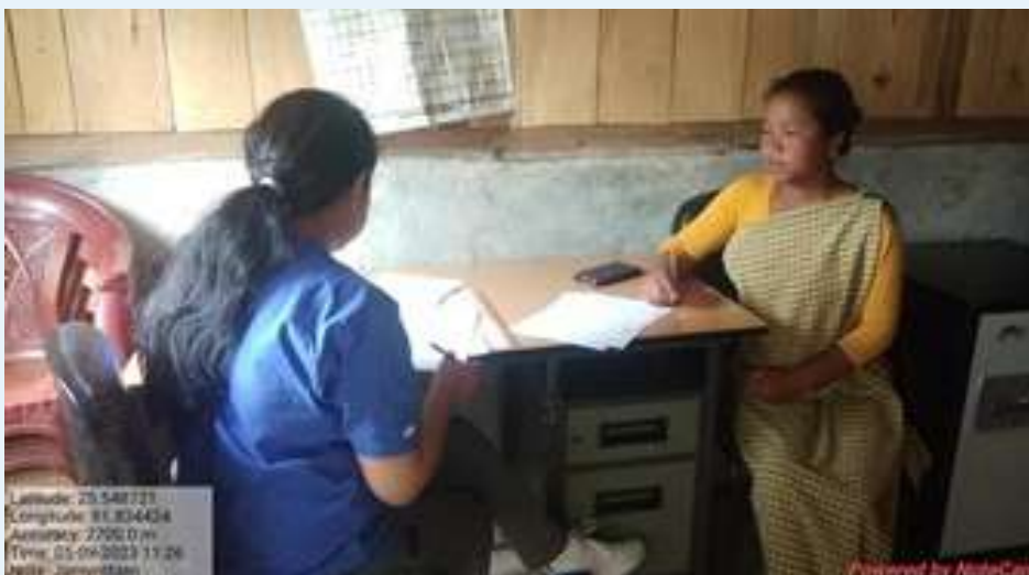
Data and signatures were collected for computerisation of Mawthwan IVCS, Jamynthlen IVCS, Mawlumrum IVCS, and Dongiewrim IVCS under Mawphlang and Sohiong C&RD Block.