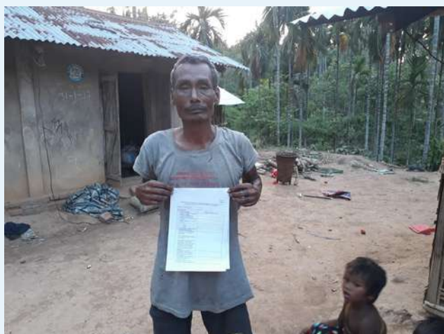
Headman of Jongnagiri village