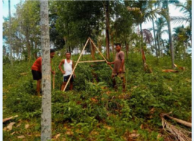
Preparation of land for SALT farm at Nanil A'pal, Resubelpara, NGH