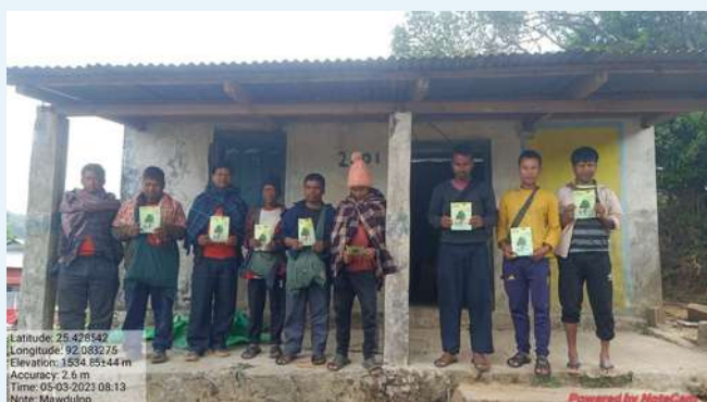
Mawdulop Village East Khasi Hills