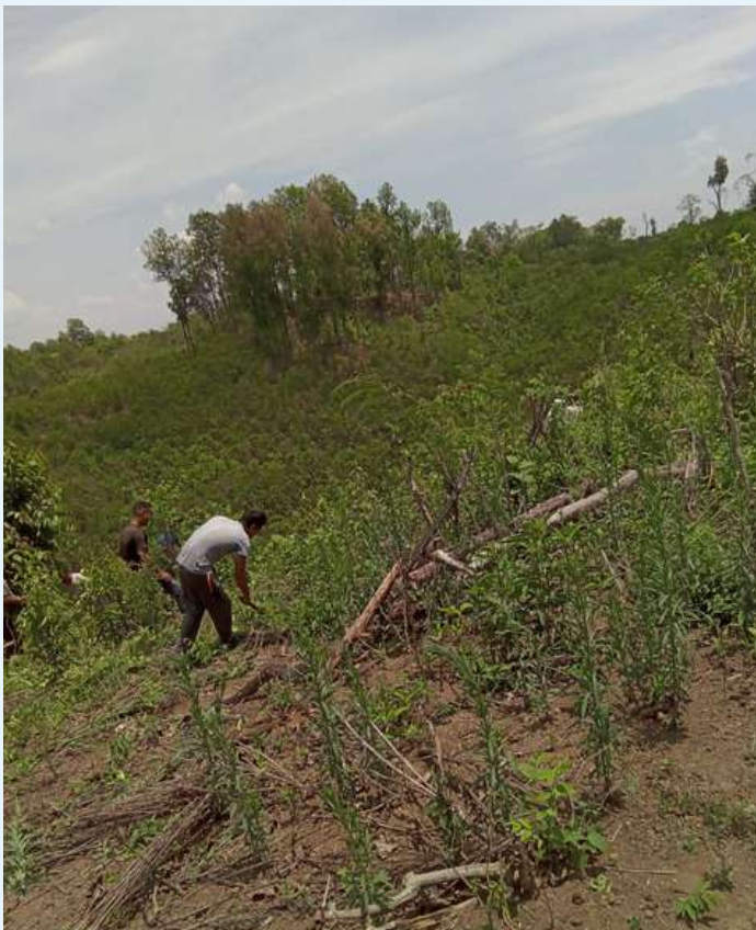
Clearing of land at Dolwarigre Village, Samanda, EGH