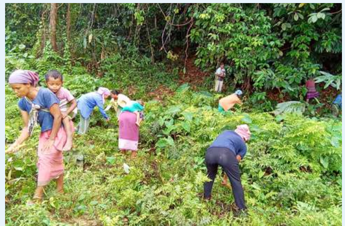
Skagre Village, Betasing, WGH